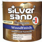
SS Premium Wood Finish Matt Lacquer