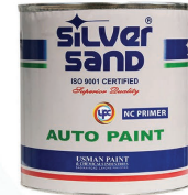
SS NC Primer