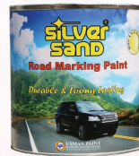
SS Road Marking