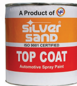
SS Fast Drying Top Coat