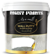
Superior Wall Putty