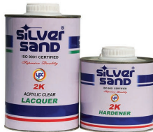
SS Acrylic Clear Lacquer