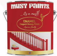
Superior Synthetic Enamel