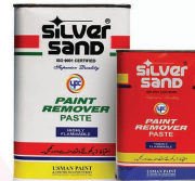
SS Paint Remover