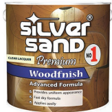
SS Premium Wood Finish Lacquer