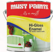
Econ Synthetic Enamel