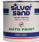
SS NC Paint & Metallics