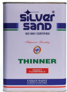
SS NC Thinner