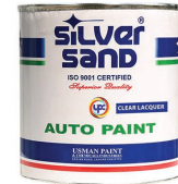
SS NC Clear Lacquer