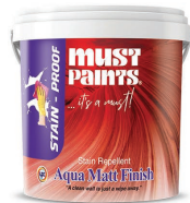
Aqua Matt Finish (Stain Proof)