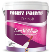
Econ Wall Putty