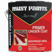
Primer Red Oxide & Undercoats