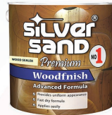
SS Premium Wood Finish Sealer