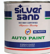
SS NC Putty