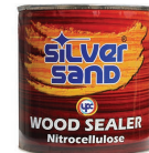
SS NC Wood Sealer